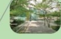
Pola Museum of Art 宝丽美术馆