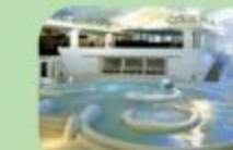
HAKONE KOWAKI-EN Yunessun / MORI NO YU 箱根小涌园森林SPA温泉乐园/森林之泉