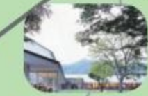
Lalique Museum, Hakone 箱根拉利克美术馆