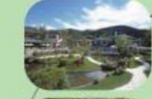
Hakone Glass Forest Venetian Glass Museum 箱根玻璃之森美术馆